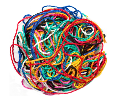
Knot by Lisa Piccirillo, pancake by DBN

We often think of knots as planar diagrams. 3-dimensionally, they are embedded in "pancakes".